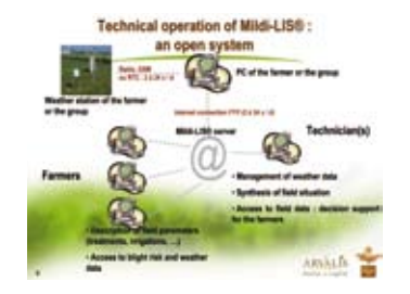
MILDI-LIS offers recommendations according to cultivar resistance

The French Plant Protection Service has issued late blight warnings since the mid 1960s. These were initially based on the Guntz-Divoux forecasting model, later complemented with the MILSOL model. During the past few years, the French Plant Protection Service and ARVALIS have each developed a DSS, known as MILPV and MILDI-LIS respectively. MILPV is based on the MILSOL forecasting model, and includes an explicit tailoring of recommendations according to the levels and types of cultivar resistance. It also includes information on the regulatory and technical rules applicable to the products (www.srpv-centre.com). MILPV includes an organic version, where the recommendations take into account